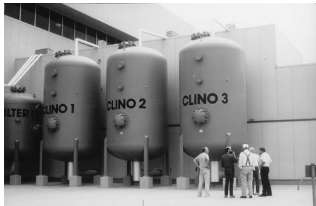
FIG. 4. Clinoptilolite-filled columns at a Denver, CO, water-purification plant [Reproduced with permission from ref. 106 (Copyright 1997, AIMAT)].

clinoptilolite for extracting \text{NH}_4^+ from municipal and agricultural waste streams. The clinoptilolite exchange process at the Tahoe-Truckee (Truckee, CA) sewage treatment plant removes >97\% of the \text{NH}_4^+ from tertiary effluent (15). Hundreds of papers have dealt with wastewater treatment by natural zeolites. Adding powdered clinoptilolite to sewage before aeration increased \text{O}_2 -consumption and sedimentation, resulting in a sludge that can be more easily dewatered and, hence, used as a fertilizer (16). Nitrification of sludge is accelerated by the use of clinoptilolite, which selectively exchanges \text{NH}_4^+ from wastewater and provides an ideal growth medium for nitrifying bacteria, which then oxidize \text{NH}_4^+ to nitrate (17–19). Liberti et al. (19) described a nutrient-removal process called RIM-NUT that uses the selective exchange by clinoptilolite and an organic resin to remove \text{N}_2 and P from sewage effluent.