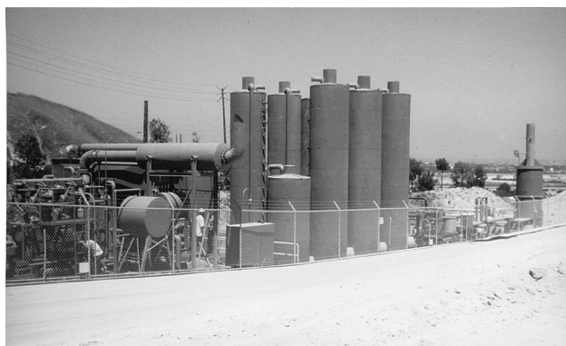
FIG. 5. Methane-purification pressure-swing adsorption unit, NRG Company, Palos Verde Landfill, Los Angeles, CA [Reproduced with permission from ref. 106 (Copyright 1997, AIMAT)].

Drinking Water. In the late 1970s, a 1-MGD (million gallons per day) water-reuse process that used clinoptilolite cation-exchange columns went on stream in Denver, CO, (Fig. 4) and brought the \text{NH}_4^+ content of sewage effluent down to potable standards ( <1 ppm; refs. 20–22). Based on Sims and coworkers' (23, 24) earlier finding that nitrification of sewage sludge was enhanced by the presence of clinoptilolite, a clinoptilolite-amended slow-sand filtration process for drinking water for the city of Logan, UT, was evaluated. By adding a layer of crushed zeolite, the filtration rate tripled, with no deleterious effects. At Buki Island, upstream from Budapest, clinoptilolite filtration reduced the \text{NH}_3 content of drinking water from 15–22 ppm to <2 ppm (25, 26). Clinoptilolite beds are used regularly to upgrade river water to potable standards at Ryazan and other localities in Russia and at Uzhgorod, Ukraine (27, 28).