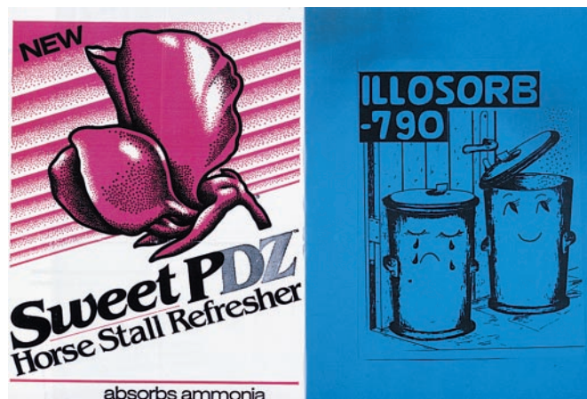
FIG. 9. Footwear and garbage-can zeolite deodorization products [Reproduced with permission from ref. 106 (Copyright 1997, AIMAT)].

Animal-Waste Treatment. Natural zeolites are potentially capable of (i) reducing the malodor and increasing the nitrogen retentivity of animal wastes, (ii) controlling the moisture content for ease of handling of excrement, and (iii) purifying the methane gas produced by the anaerobic digestion of manure. Several hundred tonnes of clinoptilolite is used each year in Japanese chicken houses; it is either mixed with the droppings or packed in boxes suspended from the ceilings (K. Torii, unpublished work). A zeolite-filled air scrubber was used to improve poultry-house environments by extracting NH_3 from the air without the loss of heat that accompanies ventilation in colder weather (93). Granular clinoptilolite added to a cattle feedlot ( 2.44 \text{ kg/m}^2 ) significantly reduced NH_3 evolution and odor compared with untreated areas (94). As more and more animals and poultry are raised close to the markets to reduce transportation costs, the need to decrease