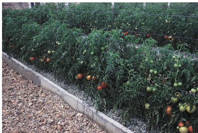
FIG. 6. Tomatoes grown zeoponically in Havana, Cuba.

These reactions await serious physiological and biochemical examination.