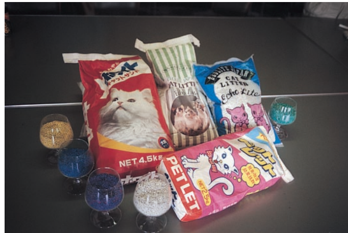
FIG. 8. Zeolite deodorization products from Itaya, Japan.

ingly soluble phosphate minerals (e.g., apatite; refs. 80 and 81). The small amount of Ca in the soil solution in equilibrium with the apatite exchanges onto the zeolite, thereby disturbing the equilibrium and forcing more Ca into solution. The apatite is ultimately destroyed, releasing P to the solution, and the zeolite gives up its exchanged cations (e.g., K^+ or NH_4^+ ). Taking the zeolite-apatite reaction one step further, the National Aeronautics and Space Administration prepared a substrate consisting of a specially cation-exchanged clinoptilolite and a synthetic apatite containing essential trace nutrients for use as a plant-growth medium in Shuttle flights (Fig. 7). This formulation may well be the preferred substrate for vegetable production aboard all future space missions (82) and in commercial green houses.