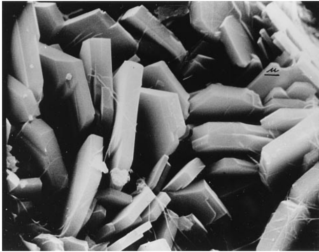
FIG. 1. Scanning electron micrograph of plates of clinoptilolite from Castle Creek, ID [Reproduced with permission from ref. 3 (Copyright 1976, The Clay Minerals Society)].

exchangers, e.g., organic resins and inorganic aluminosilicate gels (mislabelled in the trade as “zeolites”), the framework of a crystalline zeolite dictates its selectivity toward competing ions. The hydration spheres of high field-strength cations prevent their close approach to the seat of charge in the framework; hence, cations of low field strength are generally more tightly held and selectively exchanged by the zeolite than other ions. Clinoptilolite has a relatively small CEC ( \approx 2.25 meq/g), but its cation selectivity is